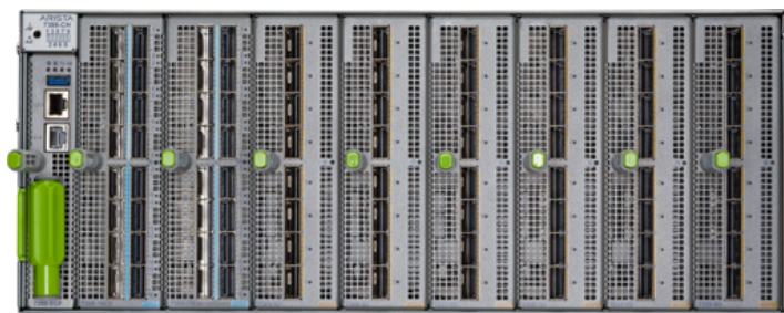
Arista 7388X5: System Front 128 ports of 100G

The Arista 7388X5 series switches support port to port latency as low as 825 ns in cut-through mode, and a 114 MB packet buffer with a large shared pool allowing for superior burst absorption compared to multi-chip systems or pre-allocated fixed per-port buffering.