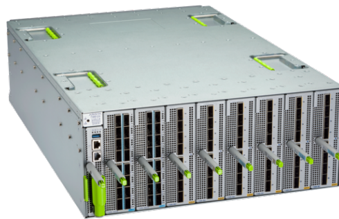
Arista 7388X5: 128 ports of 200G or 64 ports of 400G

Combined with Arista EOS the 7388X5 series deliver advanced features for hyperscale networks, serverless compute, big data farms and machine learning clusters.