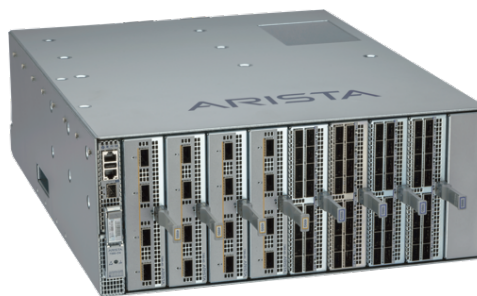
Arista 7358X4: 128 ports of 25G or 100G, or 32 ports of 400G

All elements of the 7358X4 are field replaceable, and optimized for simple maintenance, a broad range of network interfaces with a choice of industry standard interfaces allowing for easy transitions to the latest 100G/400G networks. Combined with Arista EOS the 7358X4 series deliver advanced features for high performance enterprise data centers, HPC and machine learning clusters.